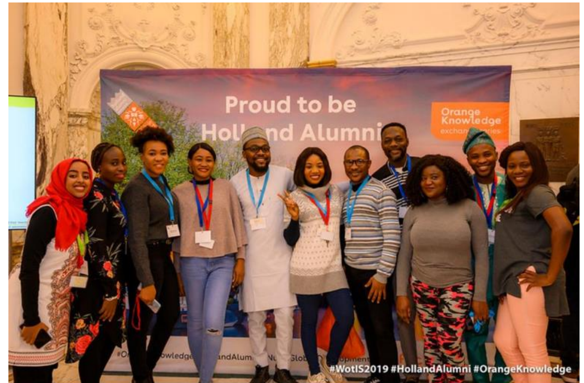
'Day of the International Student' in Amsterdam